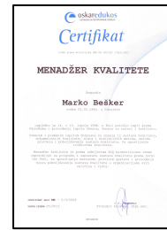
Oskar Edukos Certificate