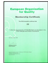
European Organization for Quality Certificate